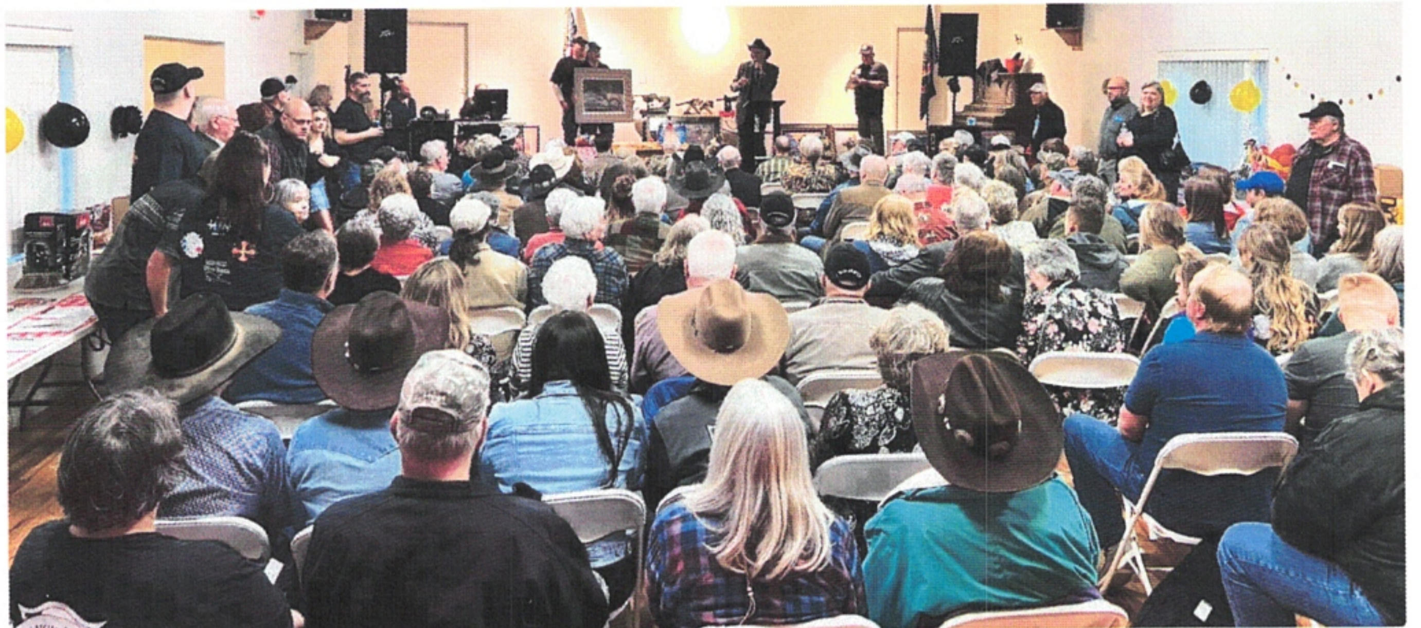
Standing room only at the First Responders Bash Auction in March!